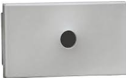
TOP: Model 1090AU