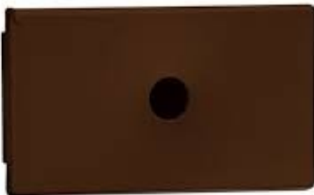
BOTTOM: Model 1090ZU