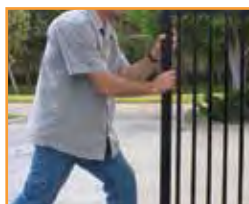
fail-safe release never be locked out (or in)