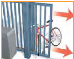
entrapment detection reverses gate when obstructed