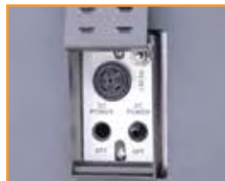
built in power switch and reset switch