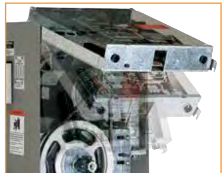
unique design allows easy access to all mechanical parts