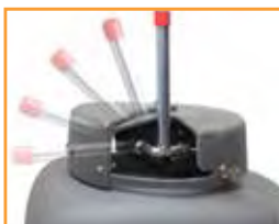
simple manual release