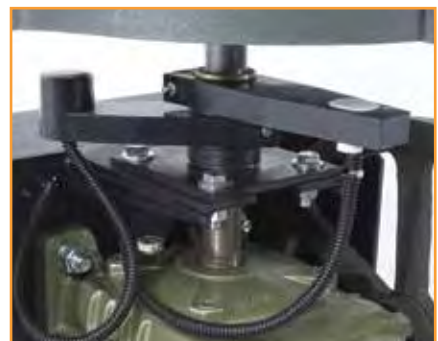
easily adjustable electronic magnetic limits