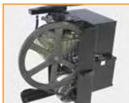
steel frame for strength and durability