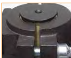
breakaway hub prevents gearbox damage