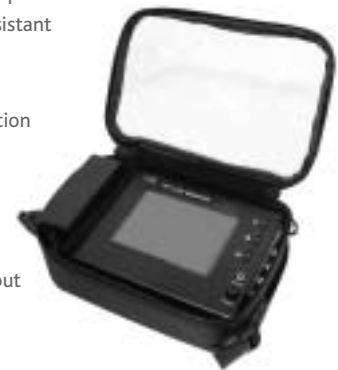
VMS-2 Extra Battery BVMS-2