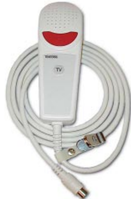
SF-401P Pillow Speaker

Tek-CARE® NC300II Nurse Call System and IR319/A or IR320/A Patient Stations