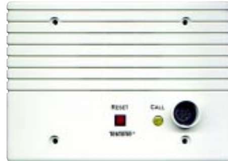
IR-319B Single Patient Station