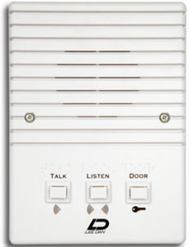
(shown smaller than actual size)

IR-105E 5 Wires. Use 2 twisted pairs, plus 1 selective #22 gauge.