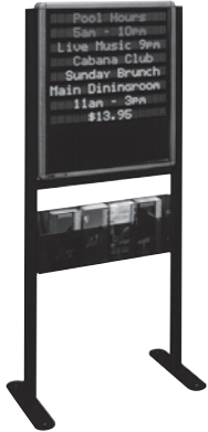
Cat. No. MC8-16C1