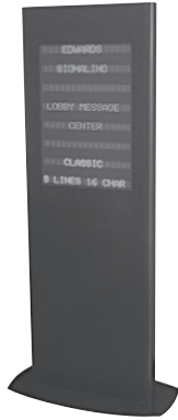
Cat. No. MC8-16C1-1