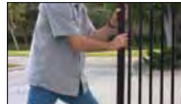
fail-safe release Never be locked out (or in) of your property