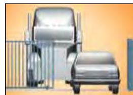
partial open allows long gates to open 14 feet for automobile traffic, or opens gate fully for large trucks or oversized vans