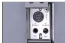
built in power and reset switches