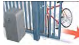
entrapment prevention system reverses gate on contact