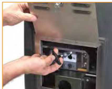
easy to use "T-Handle" release