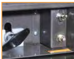
built in power switch and reset switch