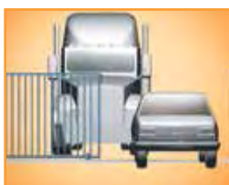
adjustable partial open for different opening distances