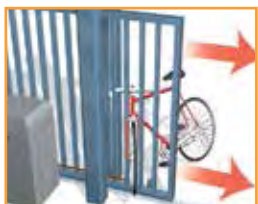
entrapment detection reverses gate when obstructed