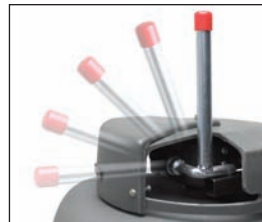
simple manual release