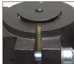
breakaway hub prevents gearbox damage