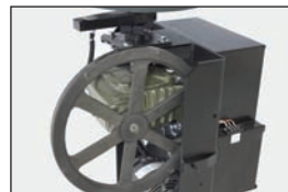
steel frame belt driven