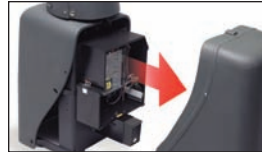
easy access case design