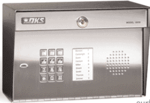
surface mount with built in directory/ message window

www.leedan.com info@leedan.com Toll-Free: 800-231-1414