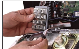
modular design makes installation and service easy