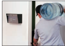
flash entry codes allow entry on a single day only, then automatically deactivate themselves