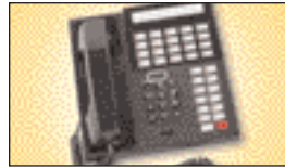
dtmf tone output allows these systems to be used with PBX, KSU and telephone systems with auto-attendants