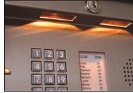
led lighting illuminates keypad and directory