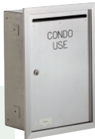
Model 491-P-628 (For private use)