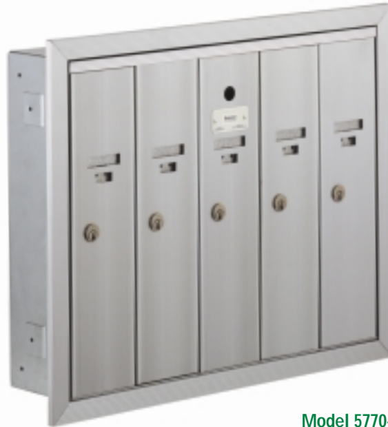
Model 5770-5 (For replacement only)

Each mailbox consists of 3 to 10 compartments enclosed within a wall box. The wall box and compartments are constructed of heavy gauge galvanized and chromated steel providing both durability and resistance to rust. Access for loading is gained by unlocking a control lock and pivoting the compartments forward.