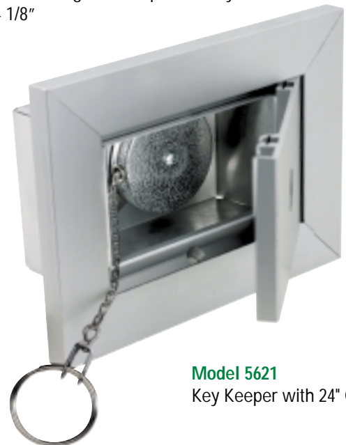
Model 5621 Key Keeper with 24" Chain

Note: Minimum rough wall depth for fully recessed units — 4 1/8"