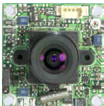
Black & White Model EM-200 (MMH112-P29)