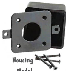
Housing Model EM-200H