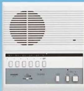
LEF-5 5-Call Master Station, surface mount