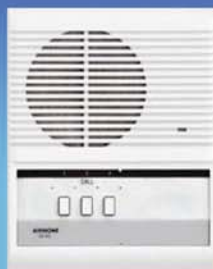
LE-A3* 3-Call Sub Station, surface mount