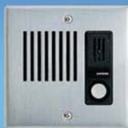
LE-DA* Door Station, stainless steel faceplate, flush mount, 2-gang