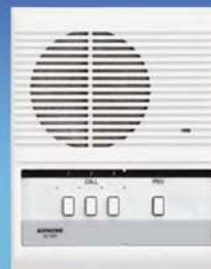
LE-AN3* 3-Call Privacy Sub Station, surface mount