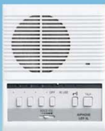
LEF-3L 3-Call Master Station with selective door release, surface mount