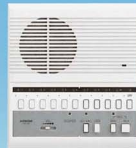
LEF-10S 10-Call Master Station with All Call, surface mount

*See back page for complete sub and door listing