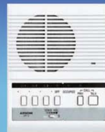
LEF-3 3-Call Master Station, surface mount