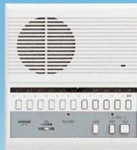
LEF-10 10-Call Master Station, surface mount