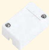
SA-1 Surge Arrestor

DISTRIBUTED BY: www.leedan.com info@leedan.com Toll-Free: 800-231-1414