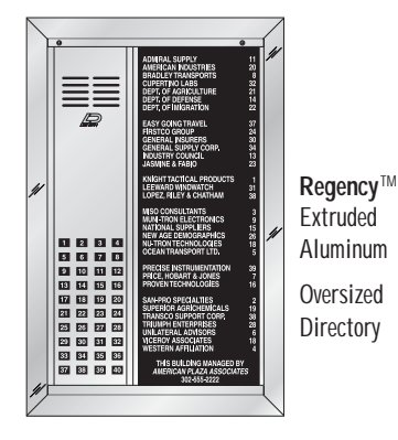
Popular Apartment Stations