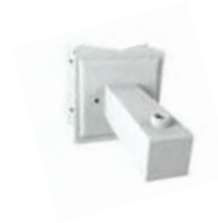
CBR Corner Mount Bracket