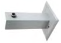
WBR Wall Mount Bracket